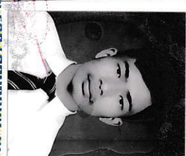
The son/daughter of