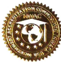
Chief Assessment Officer